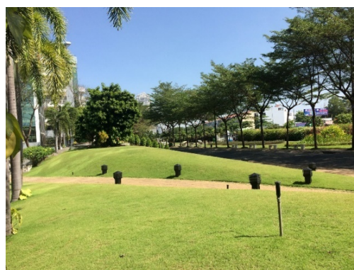
Fig. 4. trees and grass planted in TDTU

In addition, many trees and grass are planted in all campuses; and old traffics possibly causing air pollution are not allowed to get in any campus. As a result, there is no traffic pollution at all.