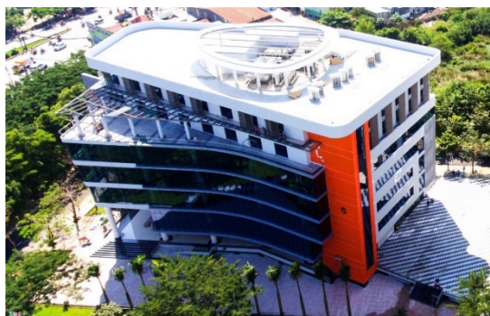
Fig. 2. TDTU new library

In addition, TDTU built a new library equipped with very modern equipment. This is a very luxurious space for our students not only to study but also to entertain. With the multimedia systems in the library, our students have no motivation to print anything out.